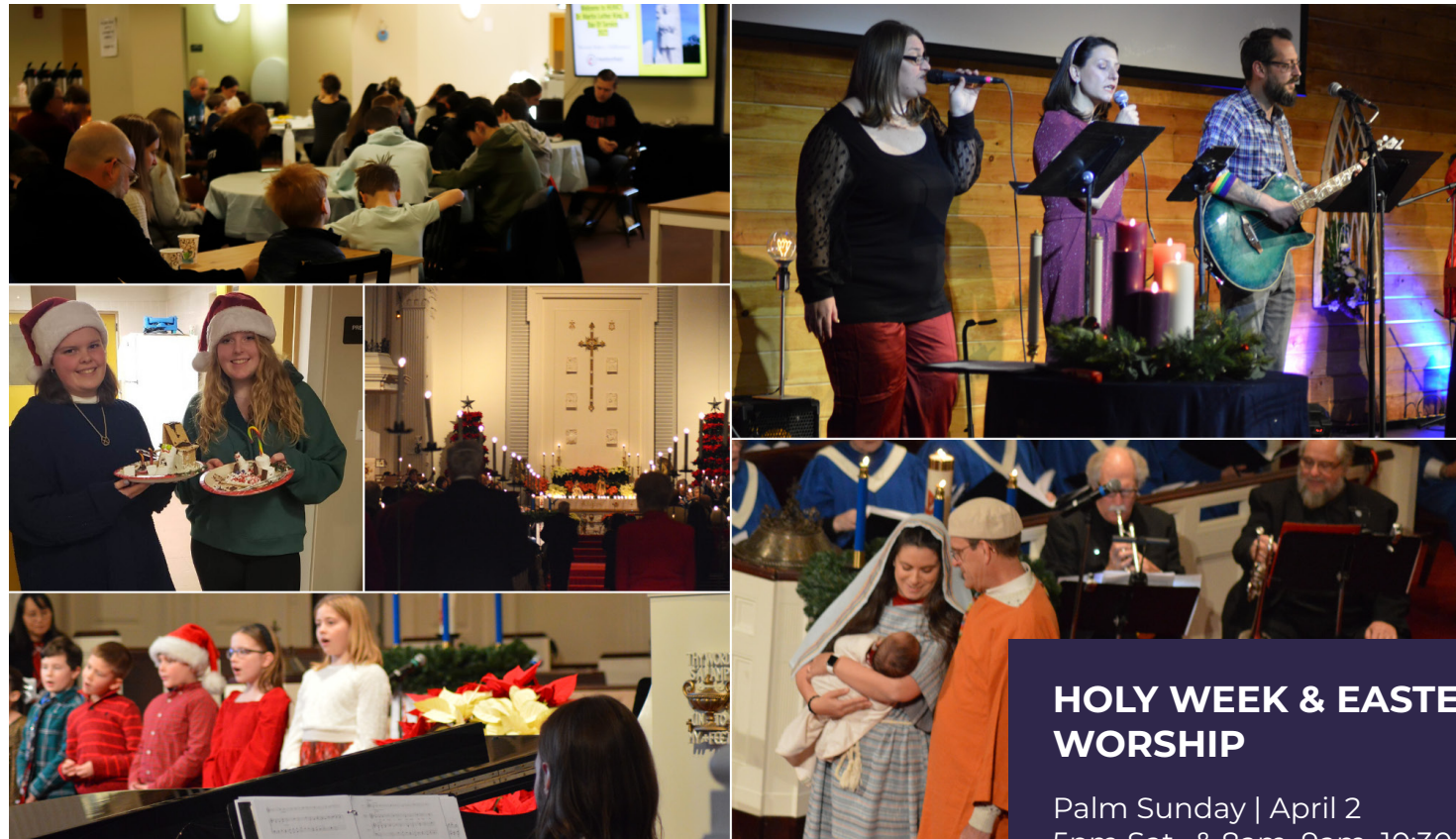
Clockwise from top right: Modern Christmas Eve Worship, Traditional Christmas Eve Worship, Children & Family Christmas Eve Worship, Traditional Christmas Eve Sanctuary (center), Student Ministries Christmas Party, Dr. Martin Luther King, Jr. Day of Service.