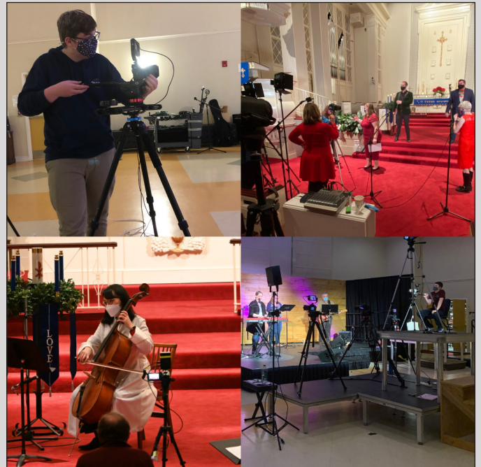
Behind-the-scenes recording virtual worship services and live-streams. Thank you to all involved in making virtual worship possible!