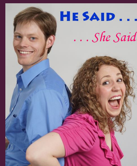
Learn more about the He Said, She Said Valentine's Day Dessert Cabaret to the left on p. 4.