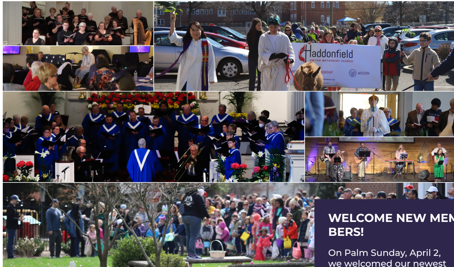
Row 1: Good Friday Seven Last Words Service, Foot Washing during the Experiential Service of Communion on Maundy Thursday, Palm Sunday Parade. Row 2: Traditional Easter Worship, Palm Sunday Procession into worship, Modern Easter Worship. Row 3: Children wait for the start of the Easter Egg Hunt. Below: Shrove Tuesday Pancake Supper.