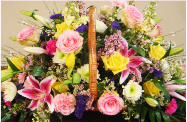
SUNDAY, MAY 8 AFTER WORSHIP WELCOME CENTER